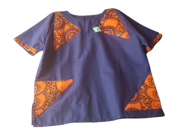
Navy Shirt all sizes

Bold, vibrant designs celebrating Limpopo's culture. Perfect for special occasions or daily wear, blending tradition with modern comfort.