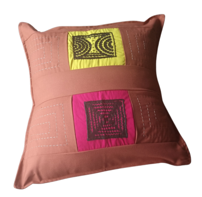
Cushion Cover: Embroider 45x45cm

Add a touch of artistry to your home with our handcrafted cushion covers. Each piece is uniquely hand printed, showcasing traditional designs that reflect the vibrant culture. Perfect for enhancing any living space with a warm, authentic aesthetic.