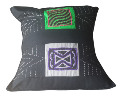
Cushion Cover: Bartik 45x45cm