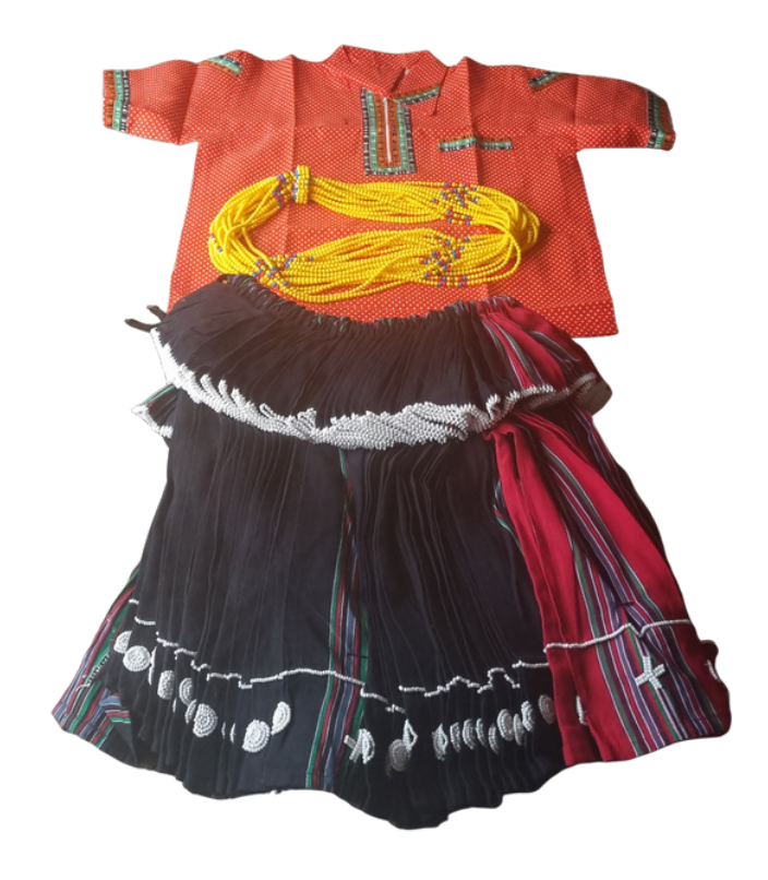
Xibelane attire combo all sizes