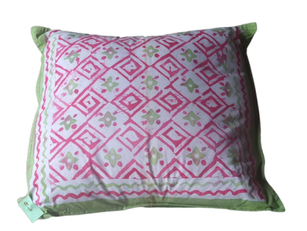
Cushion Cover: Hand Printed 40x40cm