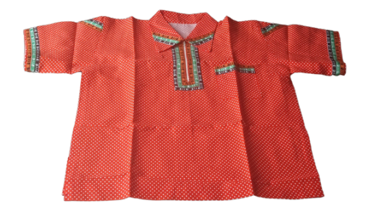
Orange Shirt all sizes