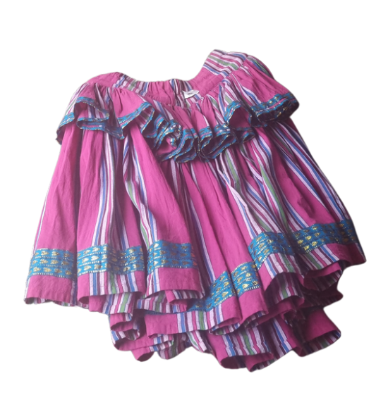
Wrap Skirt all sizes