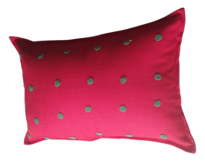
Cushion Cover: Bartik 45x45cm