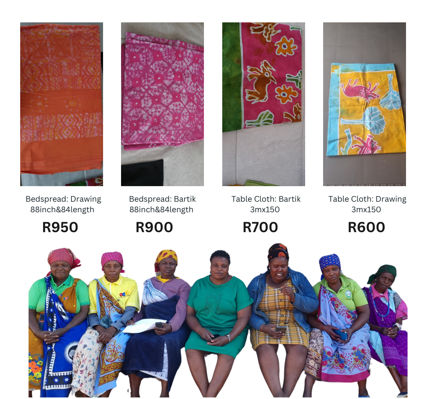
Terms & Conditions: Pricing changes in terms of courier costs and packaging. NB:Payments: Ikhokha paypoint on site, cash and immediate direct deposit are welcome.