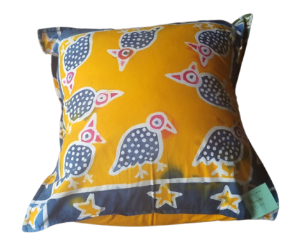
Cushion Cover: Hand Printed 40x40cm