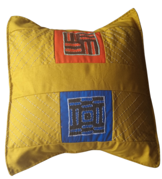
Cushion Cover: Embroider 45x45cm